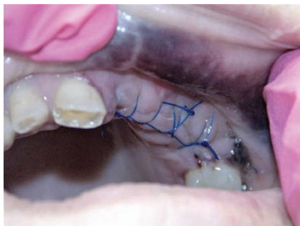
FIGURE 3. Patient I., 57 years (placebo group). The lack of 1.6, 1.5, 1.4, 2.1, 2.2, 2.3, 2.4 teeth; the 3rd day after the surgery—a large hematoma of oral mucosa of the alveolar process and the upper lip

The frequency of occurrence of oral mucosal postoperative hematomas on T_{2-3} in the patients of PG was significantly ( p < 0.05 ) higher than in the patients of LG, (33.3% versus 13.3%, respectively), including the vast, exciting area of 1-2 jaw segments and adjacent areas of oral mucosa and lips (Fig. 3), often continuing for 5 days after surgery.